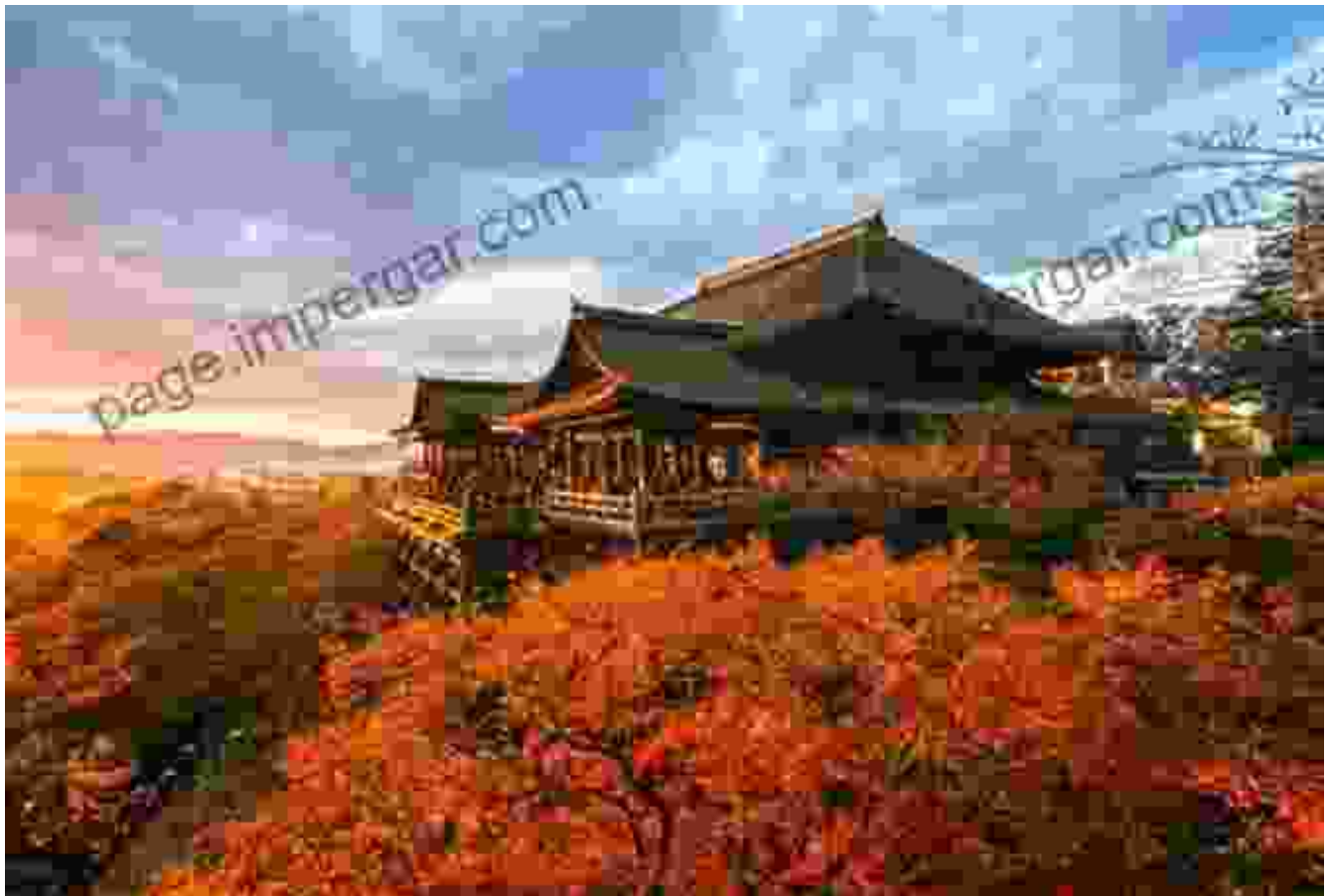
Photo Album Tsuboi Dera Temple is a masterpiece that belongs in every collection of Japanese art and architecture enthusiasts. Free Download your copy today and immerse yourself in the timeless beauty of this ancient temple.