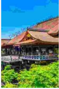
Photo album Tsuboi-dera Temple