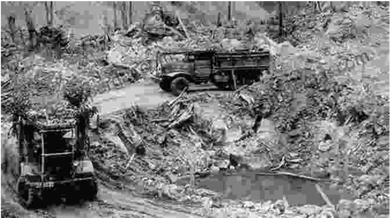
Bombing of the Ho Chi Minh Trail

The Ho Chi Minh Trail was a major target of American military operations during the war, and the US Air Force conducted extensive bombing campaigns against the trail in an attempt to cut it off. However, the NVA was able to keep the trail open throughout the war, and it remained a vital supply route for the NVA until the end of the war in 1973.