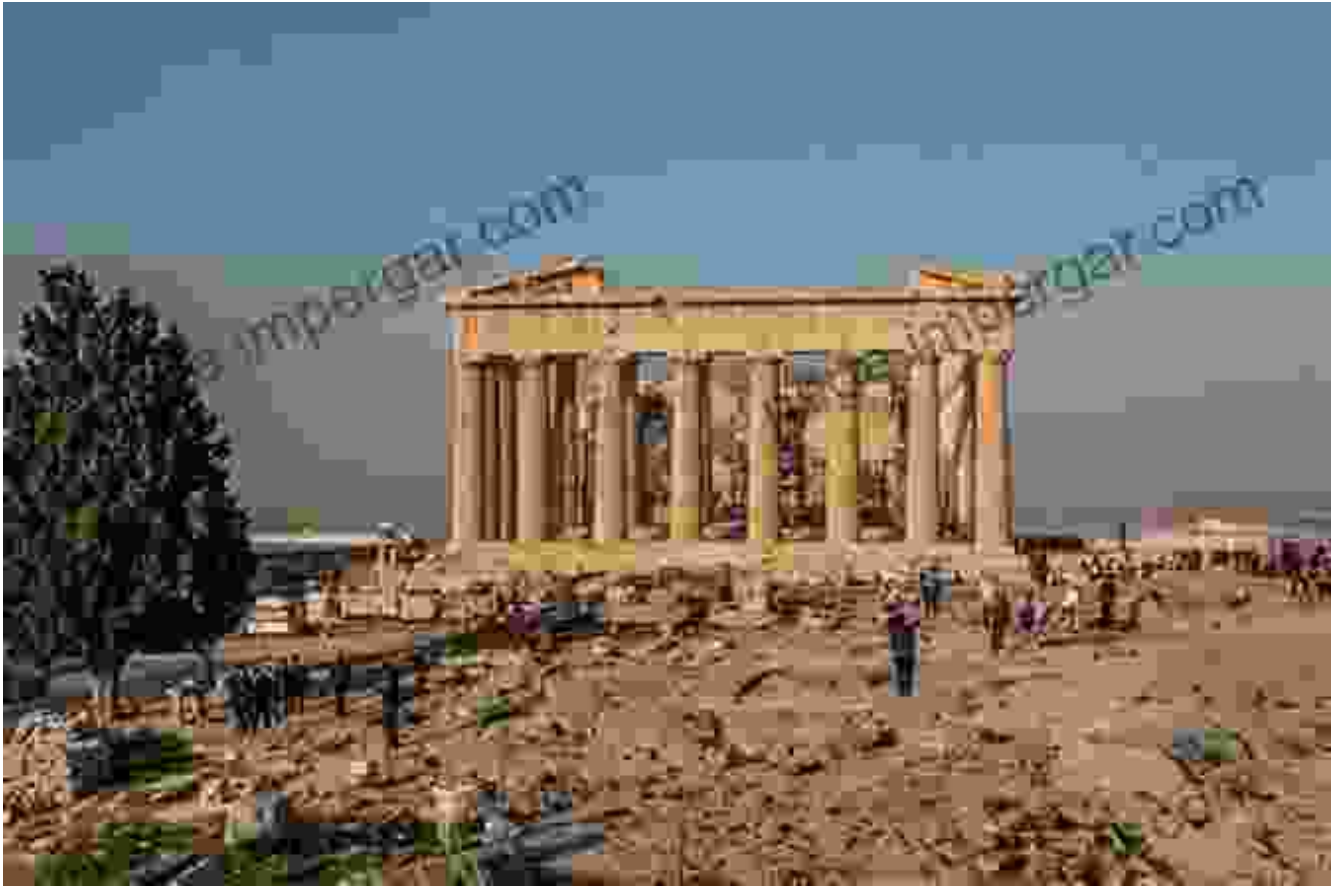
The Acropolis of Athens, a symbol of Athenian power and cultural prowess.